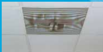
Dirty Air Diffuser