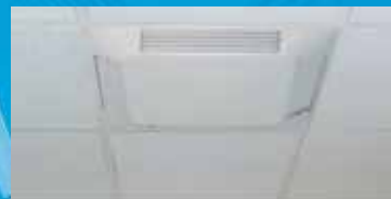
Comfort First Filtered Diffuser™